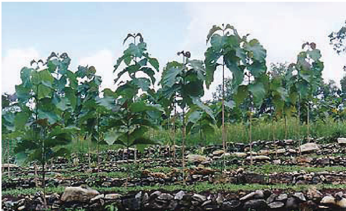
Figure 01: Afforestation programme in Tropical Africa

on the order of 1-2 PgC/yr (15-35% of annual fossil fuel emissions) during the 1990s (IPCC, 2000). The magnitude of emissions depends on the rates of deforestation, the biomass of the forests deforested, and other reductions in biomass that result from forest use. If, in addition to carbon dioxide, one considers the emissions of methane, nitrous oxide, and other chemically reactive gases that result from deforestation and subsequent uses of the land, then one could probably predict or be afraid that the world may overheat and flame-up one day if we do not continually sequester the emitting gases. Annual emissions during the 1990s accounted for about 25% of the total anthropogenic emissions of greenhouse gases (IPCC, 2000). Trends in the rates of tropical deforestation are difficult to predict, but an estimated rates shows that, another 85 to 130 PgC will be released over the next 100 years (IPCC, 2013). Emissions decline easily as degraded or abandon lands are forested or regenerated (Forest Peoples Programme, 2012; Global Canopy Programme, 2008) as in (Figure 01).