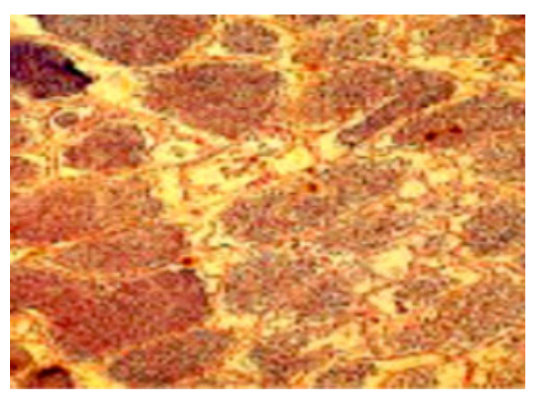
Figure 05: A photomicrograph of the cross section of C. gariepinus testes fed P. dactylifera seed powder (PDSP 5) diet showing densely filled lumen and a proper differentiated seminiferous tubule which is ready to be released.

Figure 04: A photomicrograph of the cross section of C. gariepinus testes fed P. dactylifera seed powder (PDSP 4) showing organized lobules with populated lumen.