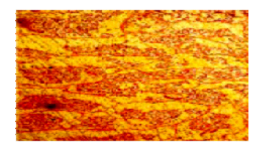
Figure 02: A photomicrograph of the cross section of C. gariepinus testes fed P. dactylifera seed powder (PDSP 2) showing equally dispersed matured spermatozoa with increased shrinked seminiferous tubules.

lobules with populated lumen and densely filled lumen respectively. The results are presented in Figure 1-5.