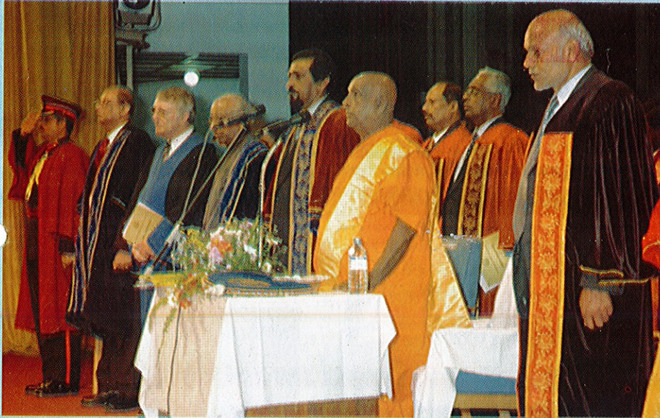
General Convocation 2009

Web: www.sab.ac.lk Email: newsletter@sab.ac.lk Tel:+94-452280014 Fax: +94-452280015