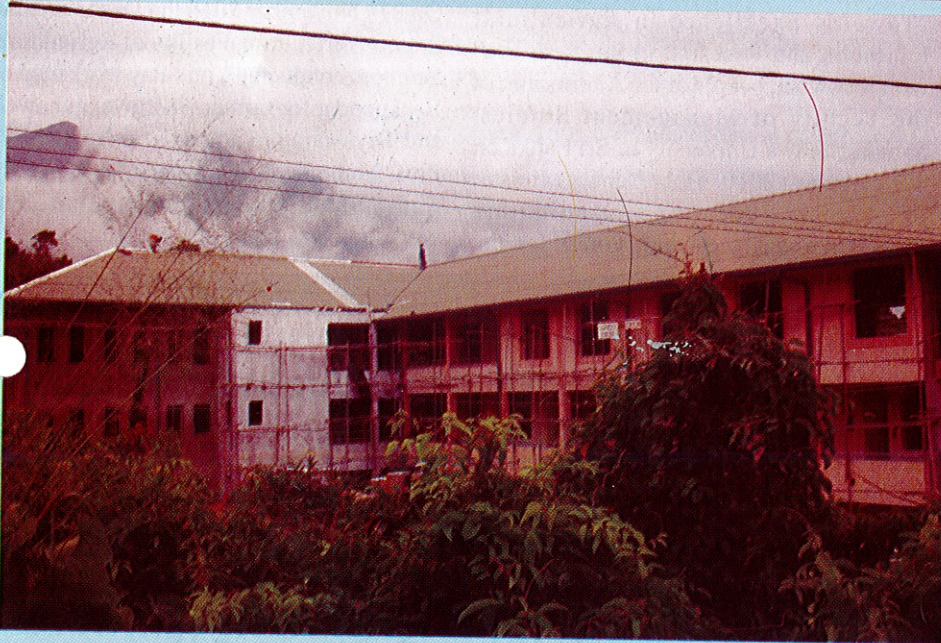
Construction of the Faculty Building of Social Sciences and Languages