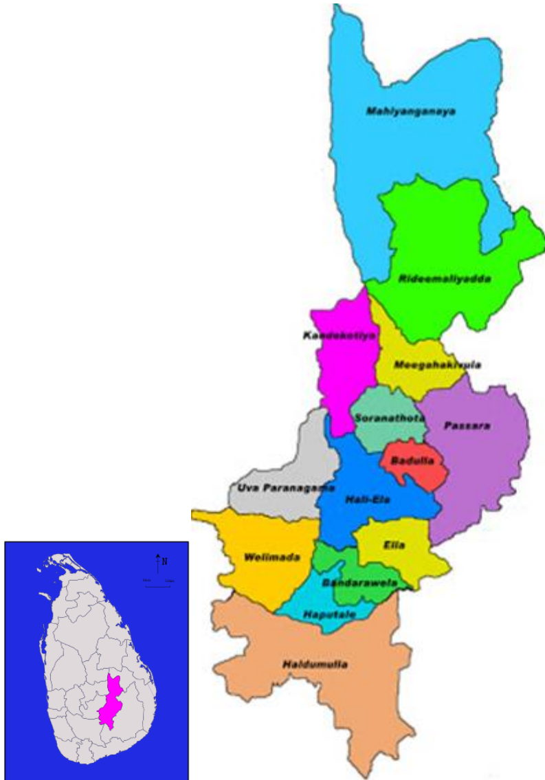
Figure 1: Divisional Secretariat Divisions in Badulla District, Sri Lanka