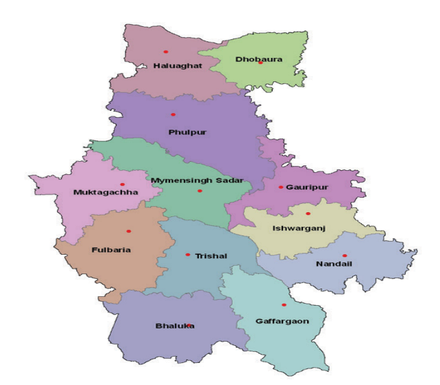
Figure 01: Selected study areas (Mymensinghsadar and Muktagacha) in Mymensingh district

The Safety-First principle is used to estimate risk attitude coefficient. Safety-First principle was first introduced by Kataoka (1963). This model was modified by Moscardi and de Janvry (1977) and utilized by Amaefula et al., (2012). This principle assumes that the objective of a farmer is to minimize the probability of experiencing variability in tomato production. The Cobb-Douglas production function is used for functional analysis of the data. It is a homogeneous function that assists to measure the return to scale and interpret the elasticity coefficients. The productivity of tomato is likely to be influenced by different factors like human labor, seed, fertilizer, pesticide, irrigation etc. The empirical form of the Cobb- Douglas regression equation is as follows: