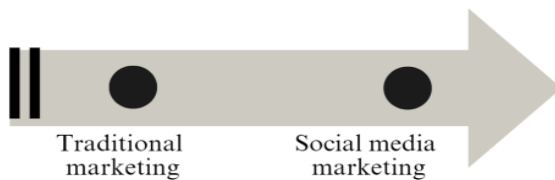
Figure 01: Transformation of Marketing Process

Social media and digital marketing have significantly influenced customer behaviour and thinking in the modern world. According to Zyman (1999), “Traditional marketing is not dying – it’s dead!” Utilising the internet and digital media the marketing has become more essential to corporate strategy in the modern world than the traditional marketing. The internet revolution has profoundly influenced customers. The consumer decision-making process model incorporates social media and platforms at each stage, increasing awareness among fashion conscious consumers. These days almost everyone has access to the internet and keeps up with all social media sites via smartphones (Kemp, 2017).